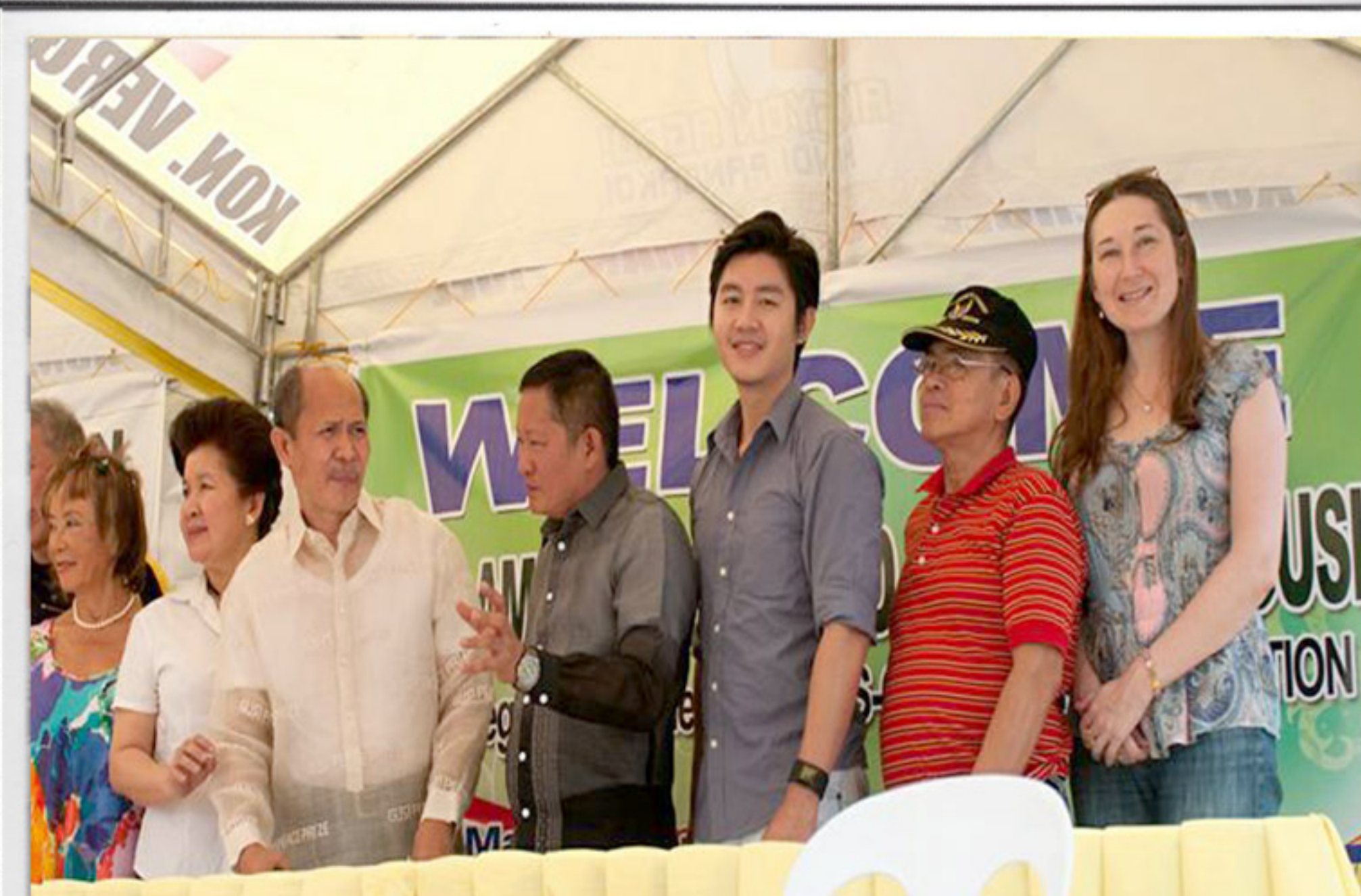
Members of the Board of Trustees of Gusi Peace Prize who participated in the Grand Charity.