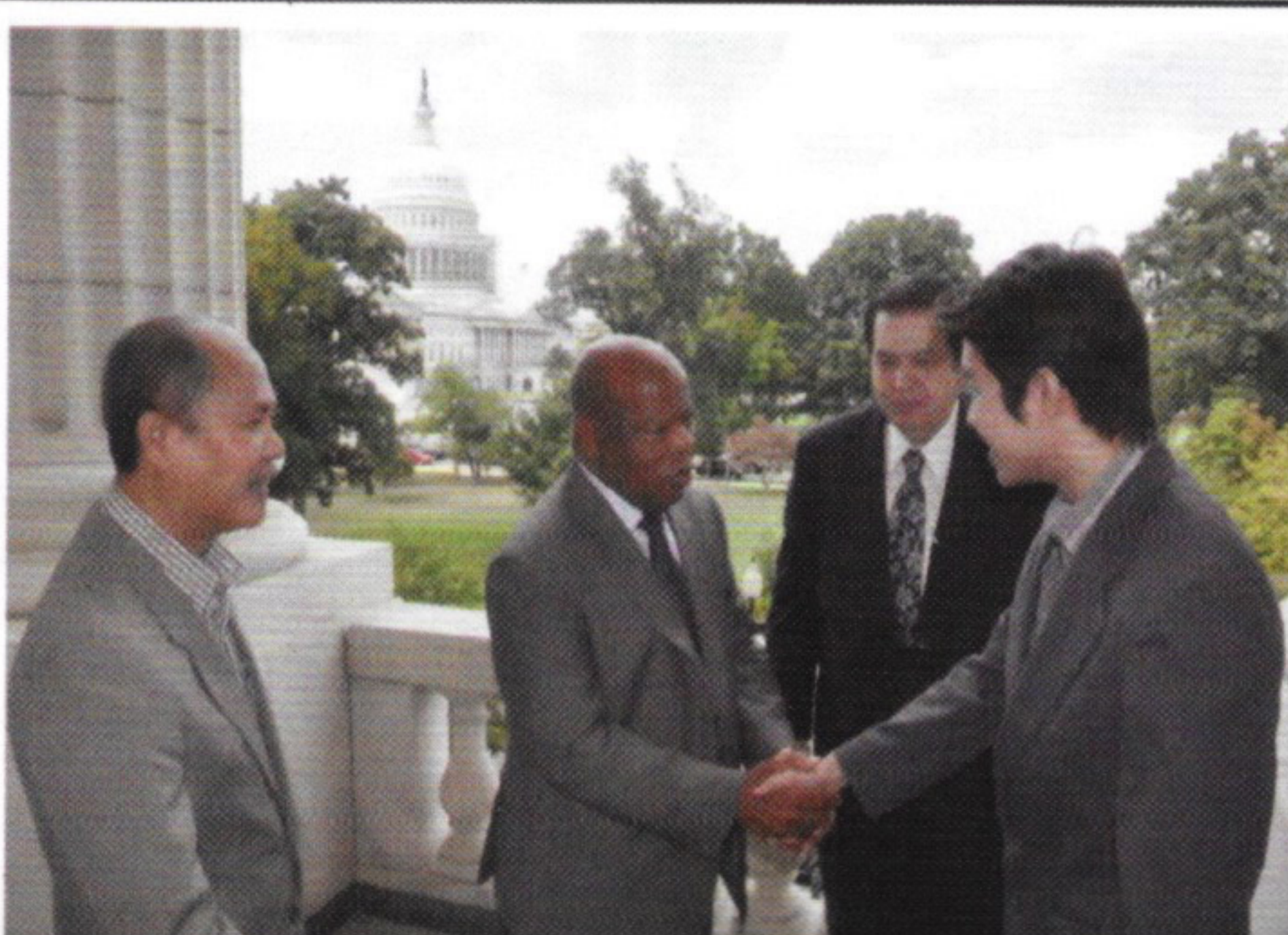
Visit to legendary United States Congressman John Lewis (Atlanta, Georgia) at Washington, D.C. last October 2014.