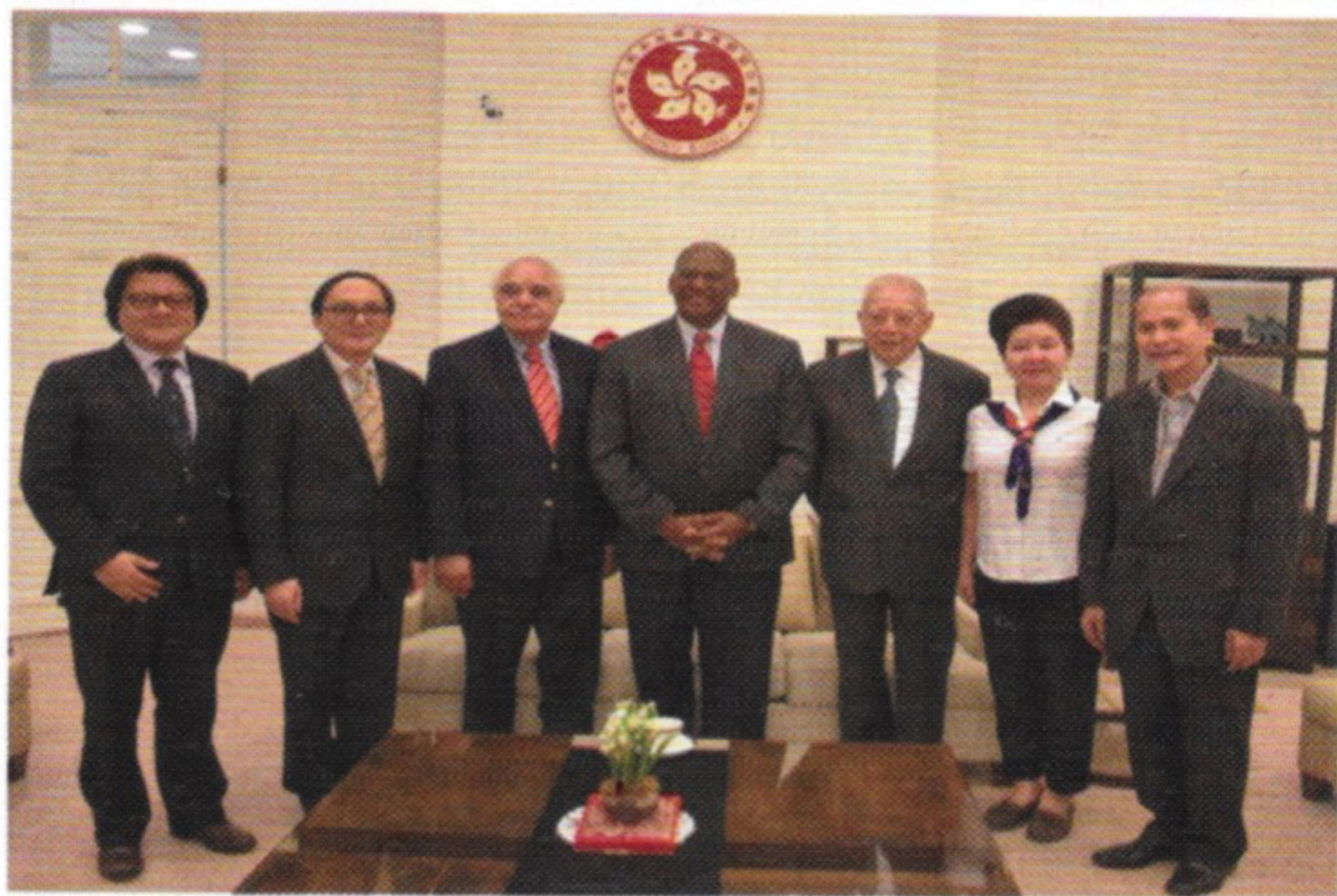
Meeting with former governor of Hong Kong, Honorable Tung Chee Hua in Hong Kong.